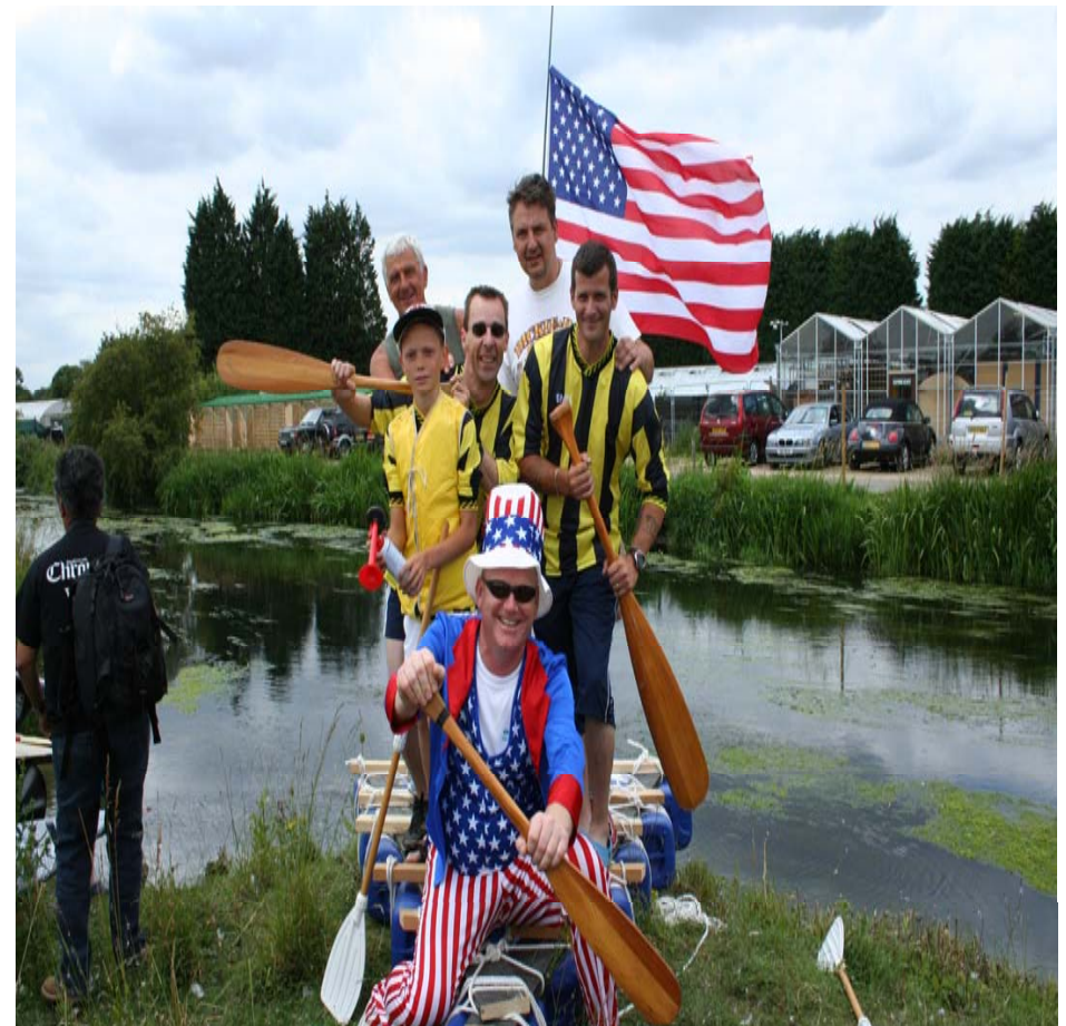
The Bedfordshire Centre Raft Race Team—2009