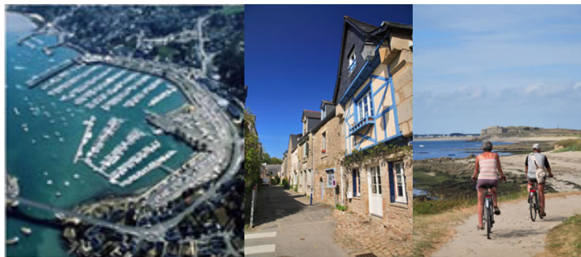
Porte De La Trinite Sur Mere

Camping Le Moustoir is just minutes away from the famous standing stones and close to the magnificent Carnac & Quiberon beaches. From the campsite you can visit Carnac, La Trinité sur Mer, Belle Ile en Mer, Houat, Quiberon, Auray, Vannes, Lorient and many other towns and villages.